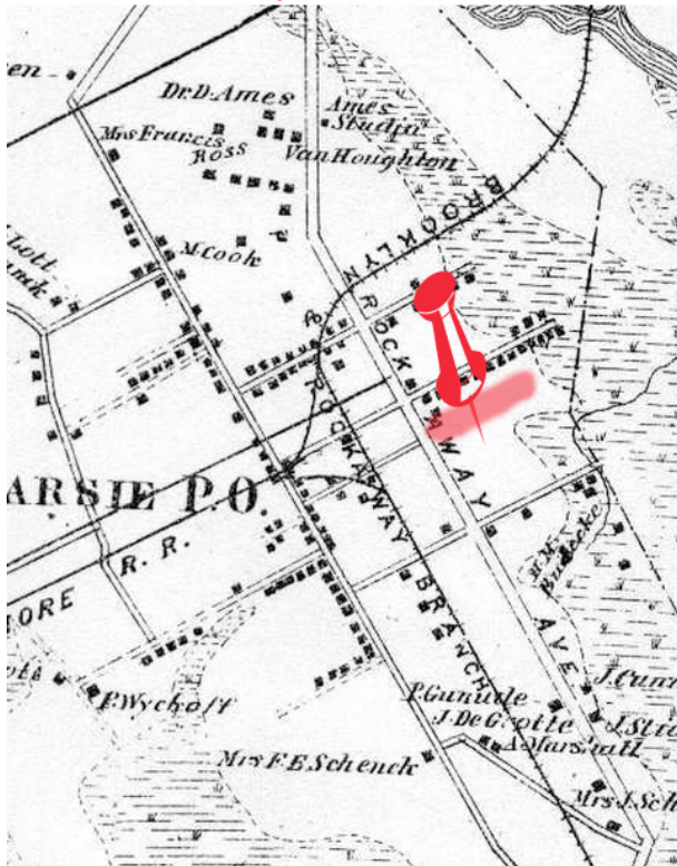
Flatlands, Brooklyn, Kings Co - 1873 Johnson's Map