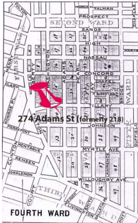
Brooklyn Ward Map 1872 https://bklyn-genealogy-info.stevemorse.org <New house numbers 1871/1872>