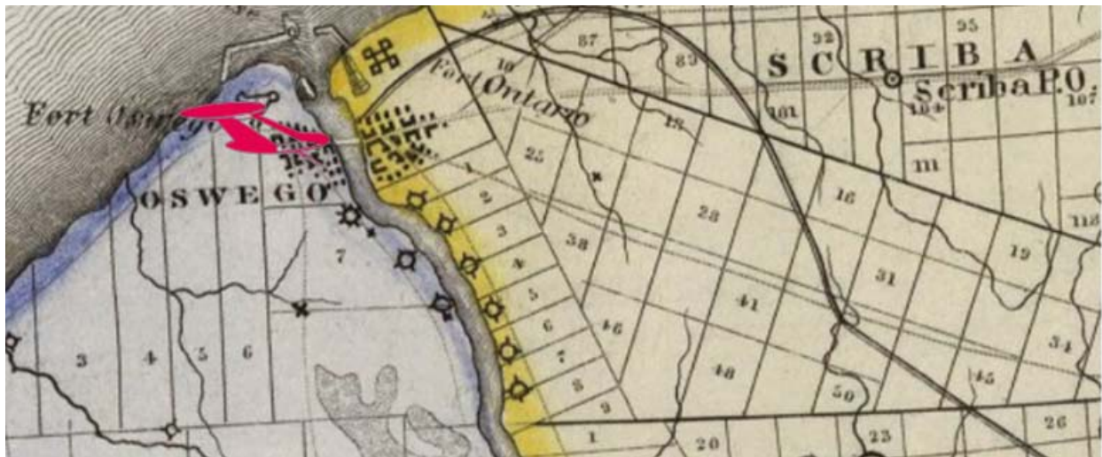
West Mohawk and West 3rd Street, Village of West Oswego, 1840