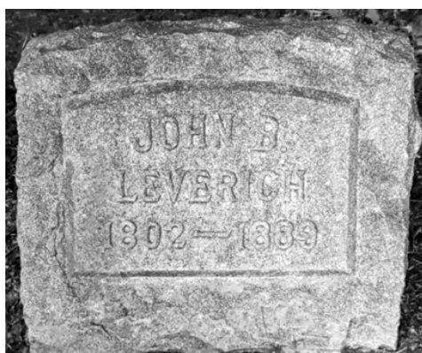
Riverside Cemetery, Oswego, New York