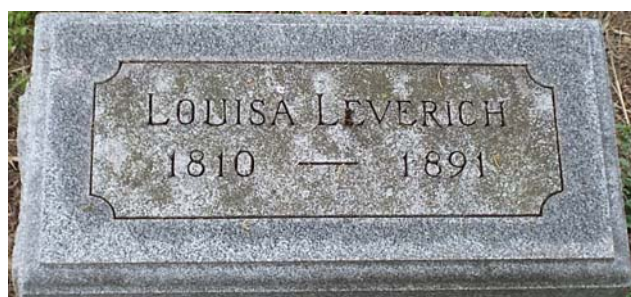
Riverside Cemetery, Oswego, New York