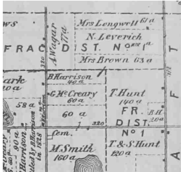
Prairie Ronde Township, Northeast Corner, 1873