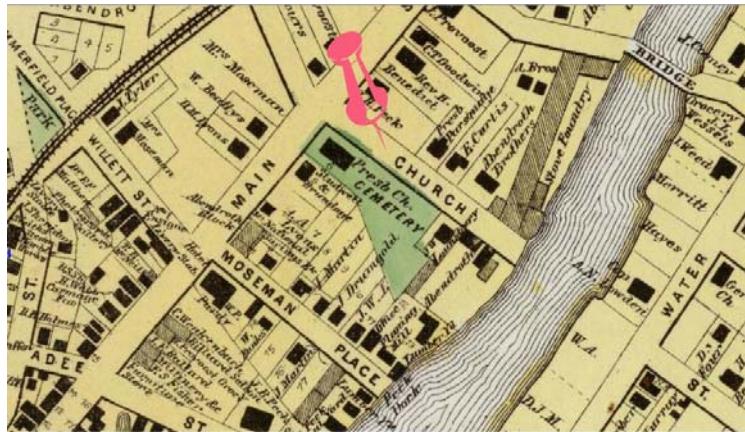
1868 Map of Port Chester, Town of Rye, Westchester Co, New York F.W. Beers & Co, New York City