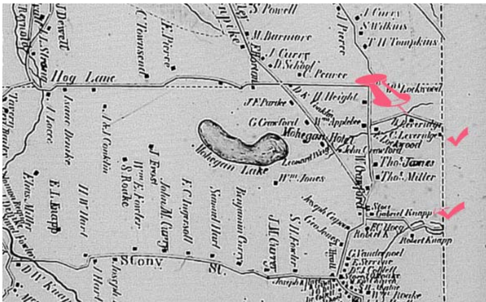
Benjamin & Eunice Leverich: Yorktown, Westchester Co, NY 1851 Atlas Sidney and Neff

Benjamin is also recorded in the non population schedule of Production of Agriculture, farming 20 acres of land, 15 acres improved 5 acres unimproved. The value of the farm is listed as $2,000 and the value of improvements and machinery is given as $50. Seven livestock are valued at $200. 23,24