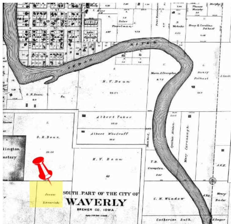
Waverly, Bremer County, Iowa