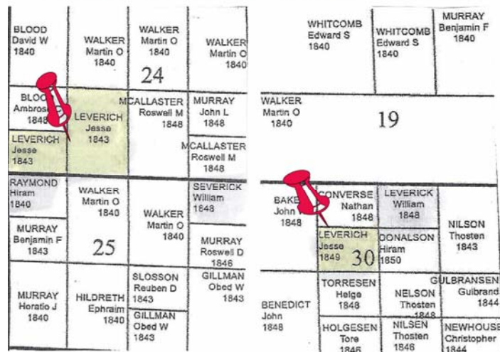
Twp 1-N Range 13 E South Half Turtle Twp Formed 1846