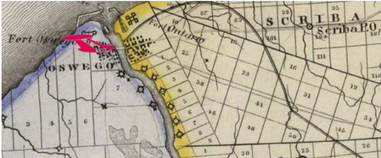
West Mohawk and West 3rd Street, Village of West Oswego, 1840