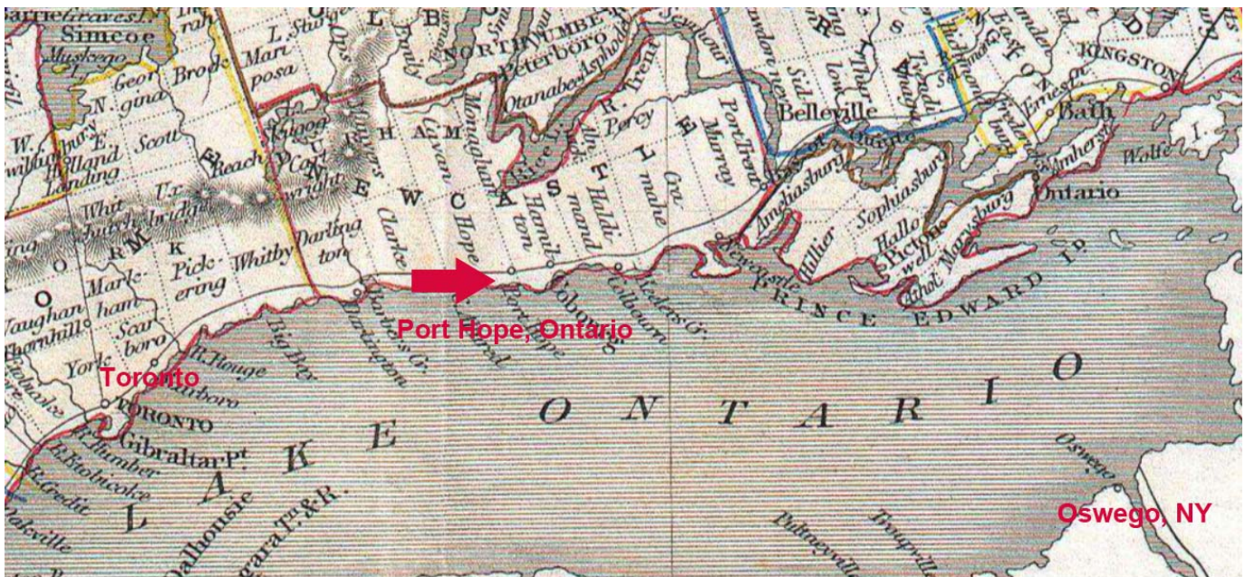
1850 Tallis Map of West Canada or Ontario, at Wikipedia Commons