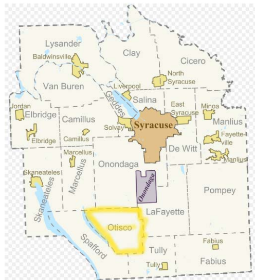
Onondaga Co NY Townships